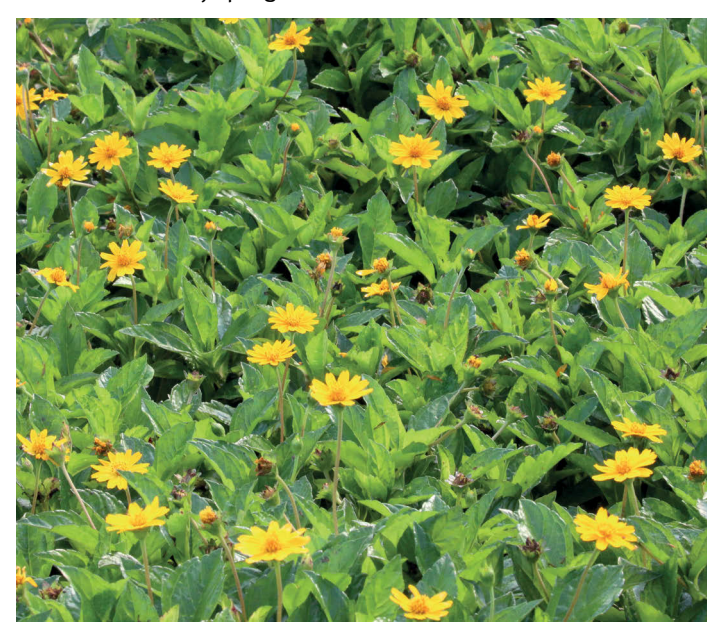
Table 1. Herbicides for control of Singapre daisy

Further information is available from your local government office, or by contacting Biosecurity Queensland on 13 25 23 or visit www.biosecurity.qld.gov.au.